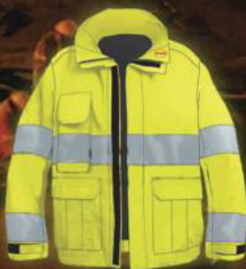
GLOBE Hi-Vis Jacket $360