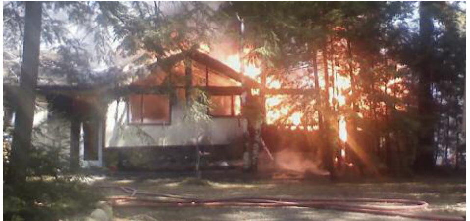
Above: PHOTO BY KIRSTEN EMERSON/JAMIE TUTTLE, STEWART'S AMBULANCE SERVICE.

March 20, first arriving units at 285 Long Point Road in Moultonborough found a single-story ranch with approximately 1/3 involvement on the A-D-C sides, with a venting propane tank and a wild land fire with exposures. 5E4, the first arriving unit, deployed a master stream and stretched a 1-3/4" line. Neighbors reported the possibility of a female still in the building. 15E1 arrived on scene, after laying in a 4" line from the beach 1,000 ft. away. Moultonborough and Center Harbor personnel entered the building to perform a primary search but were evacuated due to rapidly deteriorating conditions and flashover. With the arrival of crews from Meredith and Holderness, the fire was brought under control and confirmation was made by Moultonborough Police that the female was not in the structure at the time of the fire. No injuries were reported. 🚒