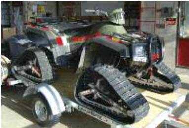
Center Harbor. ATV

2005 ATV. Also has wheels. ATV and trailer were donated by the Center Harbor Fire Association.