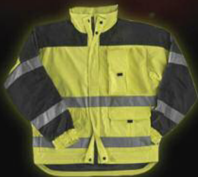
GERBER Eclipse Jacket $179