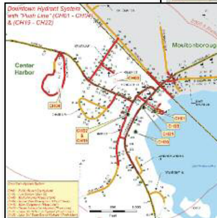
Above: Hydrant lines within the village area. Map at right shows overlapping circles where areas are served by hydrants.

The resulting coverage will lead to a reduction in insurance costs for homeowners and businesses in the village area. Eventually, when the system is finished, the entire town could see a reduction in insurance premiums.