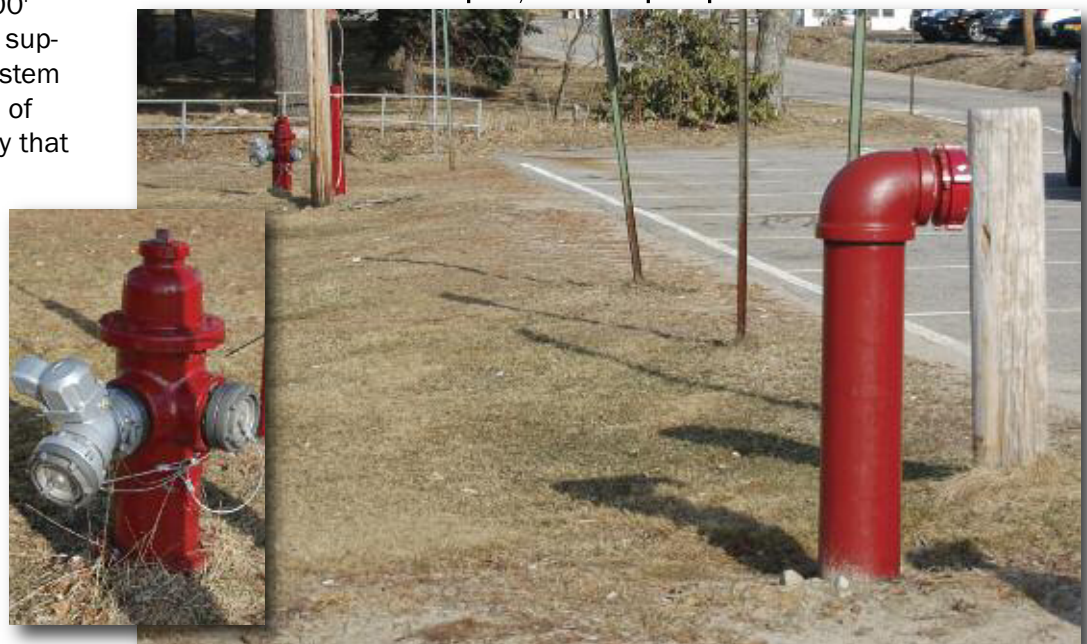
Below, left: Closeup of "push" hydrant where the hydrant system in the village begins. Below, at right is the dry hydrant that reaches out into Lake Winnepesaukee. The push hydrant is seen in the back of the photo, near the telephone pole.