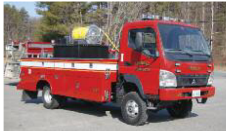
Hebron. 37 Forestry 2

2005 ATV. Also has wheels. ATV and trailer were donated by the Center Harbor Fire Association.