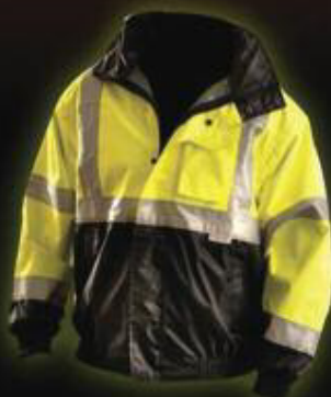
OCCUNOMIX TJ-BJ Bomber Jacket $115