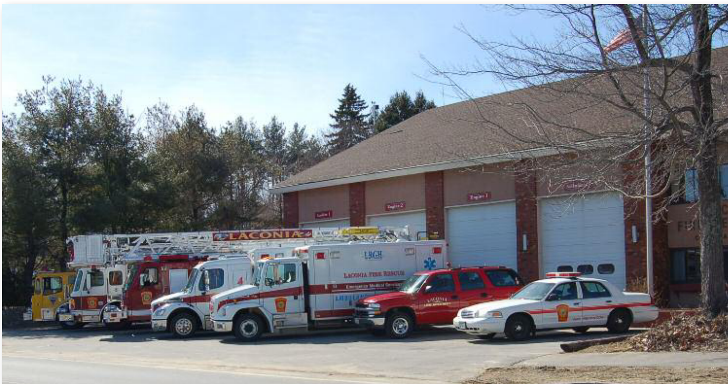
Laconia Central Station

stories in the downtown area alone as well as thousands of 2 or 3 story buildings, numerous tenements and garden-style apartment complexes. Additionally, many homes are seasonal which brings accessibility issues into play during the winter.