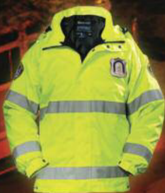
SPIEWAK S578V Public Safety Parka $150