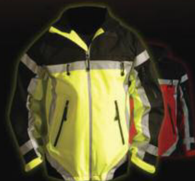
NINE-1-ONE Battalion Chief Jacket $299