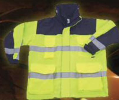
GERBER Response Parka $399